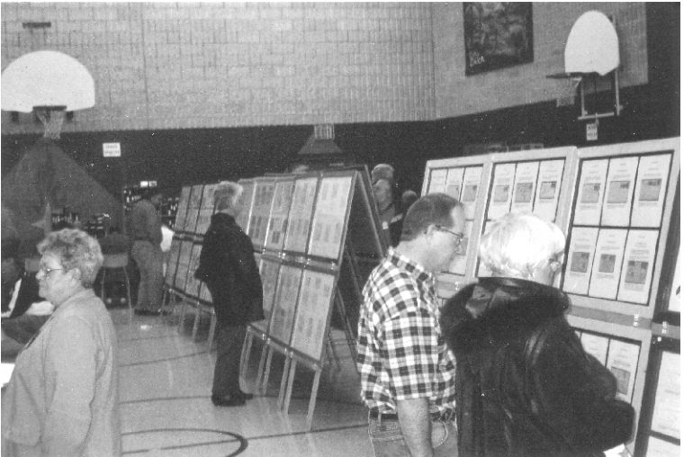
View of the Oxford Stamp Club Exhibition – There was a total of 68 six page frames at the show.