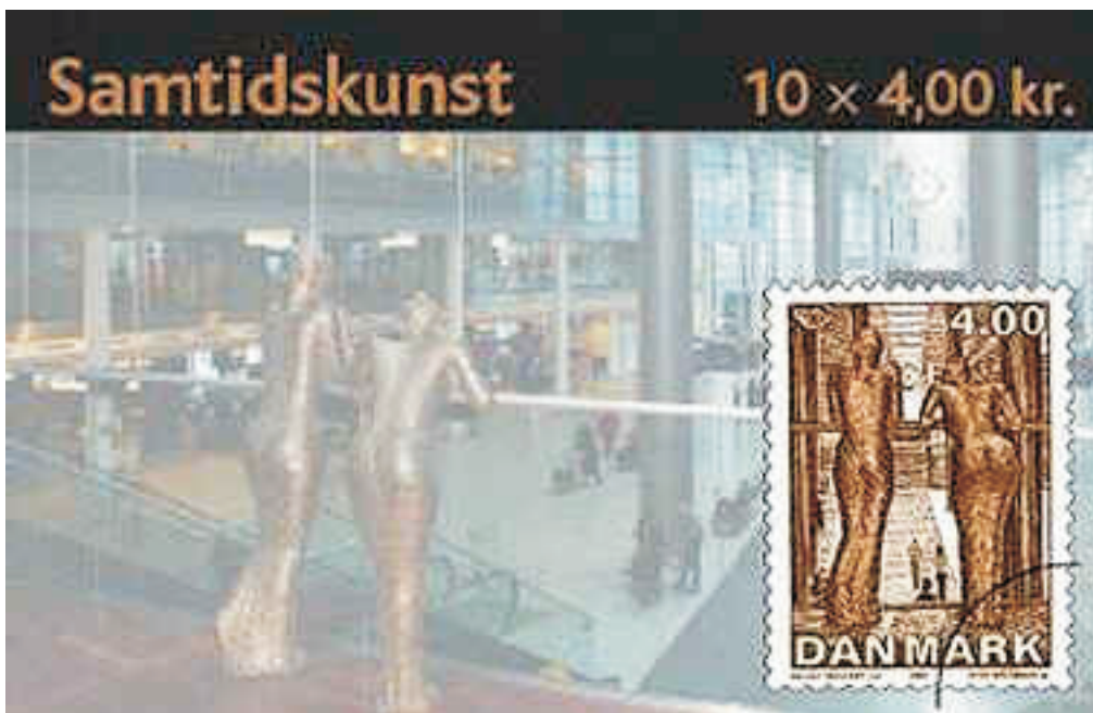
“Pigerne I Lufthavnen” – booklet cover. The stamps are sold as singles, and the 4.00 Dkr-stamp also in a booklet pane of 10 stamps. The 4.00 Dkr stamp is for a 20g-letter domestic rate, and the 5.00 Dkr-stamp is for a 20g-letter to Europe, including the (Danish) Faeroe Islands and Greenland.

On the same day they will issue a single semi-postal (of Dkr 4.00 + 0.50), from which a National Association for development impaired Danes will benefit. They will also issue three Postage Labels on that day.